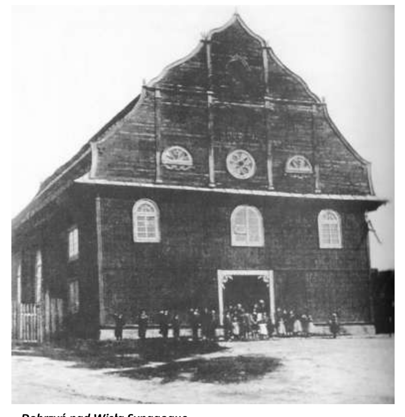
Dobrzyń nad Wisłą Synagogue