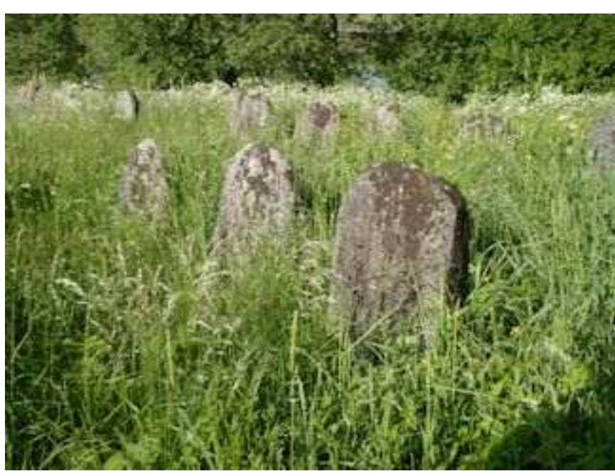
Zarasai Cemetery 2012

It is quiet here, a tiny walking track almost overgrown with waist and thigh-high flowering grasses, wild white flowers. There are ancient headstones for the graves, some leaning perilously, some still upright, among the greenery. They seem to be whispering to each other. Their whispers melt into the breeze around our ears. They are in small clusters. Later I learn that there are many more among the tall trees in the woods on the tip of the peninsula (there are perhaps 400 in all). Hebrew lettering on each points to a time and a culture, to an absence of progeny to take care of ancestors' graves.